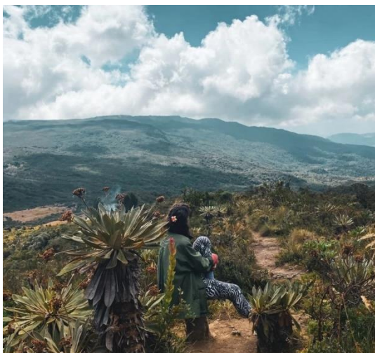
Páramo outside of Bogotá

I would like to express my sincere gratitude to ATSAF e.V. and CIAT for making this enriching experience possible.