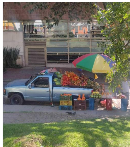
Typical local food stand